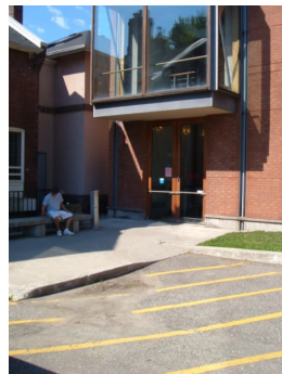
Photo 1 - Building