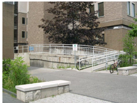
Photo 1 - Building