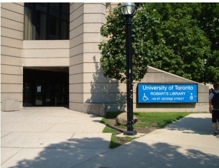
Photo 1 - Building