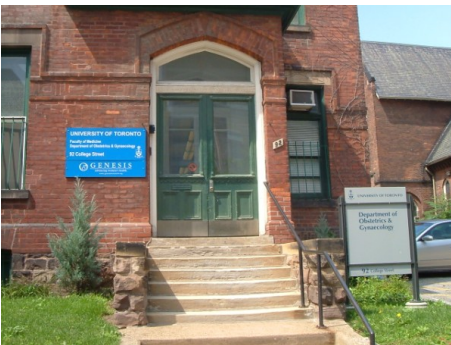
Photo 1 - Building