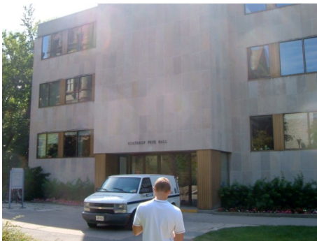
Photo 1 - Building