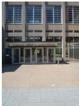
Photo 1 - Building