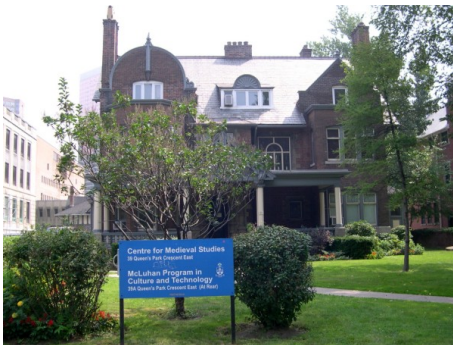
Photo 1 - Building