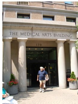
Photo 1 - Building