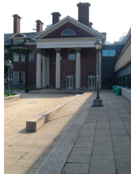
Photo 1 - Building