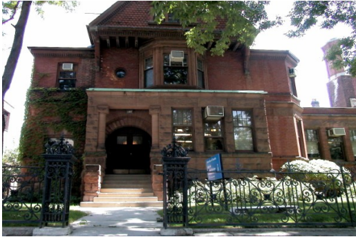
Photo 1 - Building