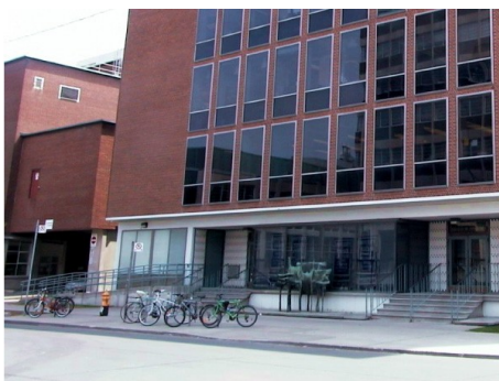
Photo 1 - Building